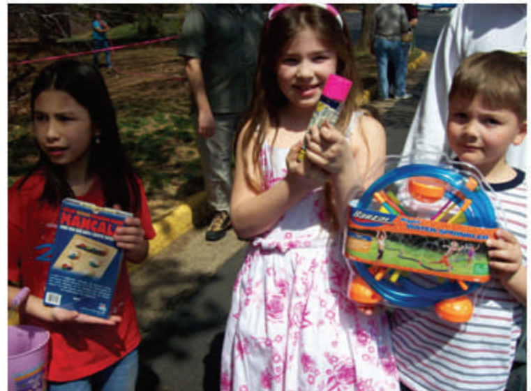
Lots of fun and great prizes!