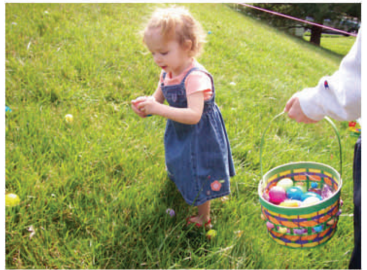
The Hunt is On!